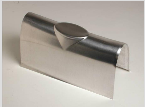
Part of an airplane engine